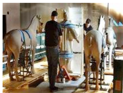
'THE MUSEUM' BBC Wales for BBC2 5 x 30'

Producer/Camera. For the first time cameras are allowed behind the scenes at the British Museum. I produced 5 of the films - one of these followed the museum's director Neil McGregor to China selecting terracotta warriors. Another film involved filming in Sudan, filming excavating mummified human remains. Described by Richard Klein as 'deftly made and with lots of neat fun touches, plus tons of info'. 2007