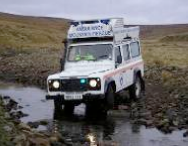
'MOUNTAIN SHOUT' 45' Bangaw for Discovery Channel

Director. For The Professionals series. Following the work of the mountain rescue service in the Brecon Beacons. 1996