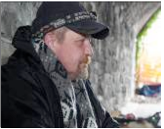
'SWANSEA: LIVING ON THE STREETS' series 1