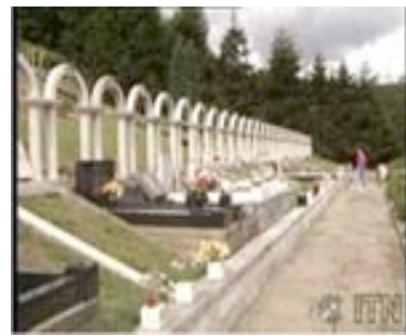
'ABERFAN - 25 YEARS OF EXPERIENCE'